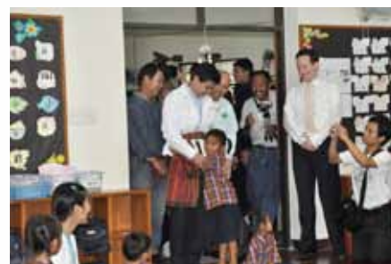
Thai Prime Minister Abhisit Visits Lamplaimat Pattana Primary School

In each sponsored community, a Village Youth Government of young people aged 14 to 24 are elected to be trained in democracy, leadership, project proposals, practical business skills, human rights, and transparency. With the practical experience gained, many new young leaders have emerged from these villages with some being elected to the local government.