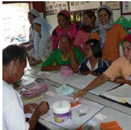
Village Development Bank in Operation