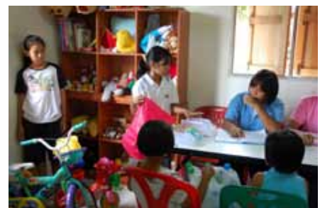
Green Village Toy Library Managed by Youth

To promote Individual Social Responsibility, the Green Village Toy Library program has been launched so that young children can recognize the joy of doing public good and, at the same time, be introduced to philanthropy. Urban children are requested to donate some of their toys and books to rural children. Toys are loaned to village children in exchange for community service and tree-planting. Along with the Village Development Partnership, this is an excellent opportunity for company employees to get involved in this new model of philanthropy.