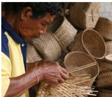
Training Ensures Villagers Can Start Their Own Successful Small Businesses