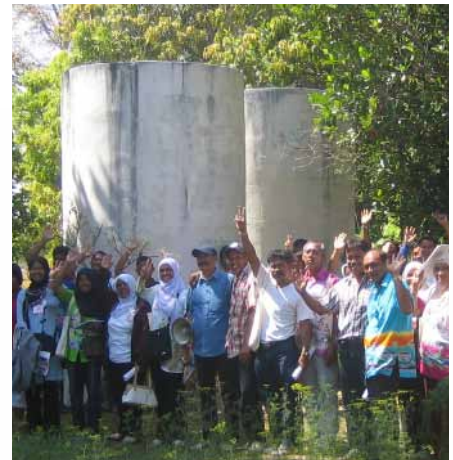
The Eye-Opener Trip Allows Villagers to Learn From Best Practices of Successful VDP Villages