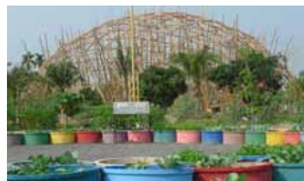
Bamboo Architecture of the Lamplaimat Pattana Secondary School

Since youth will one day be the leaders of their community, it is important to instill a sense of responsibility in children of rural areas. That is why the Lamplaimat Pattana Primary School was launched with support from the business community as a private institution for rural children, at no cost, in Buriram province (four hours from Bangkok). Through its innovative learning process, students are capable of solving complex problems with a finite amount of resources. These teaching methods have been recognized as highly successful, and the school has won praise from the Thai Ministry of Education as well as international institutions. Today, the Lamplaimat Pattana School has expanded into secondary level with its unique, environmentally-friendly bamboo architecture.