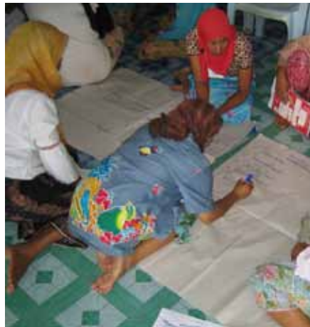
Villagers Initiating a Development Plan for the Future