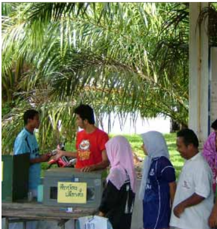
Committee Elections in Progress