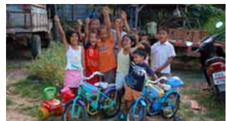
Children Enjoying Toys from the Green Village Toy Library

“The villagers can choose what they want to do and the VDP staff will give ongoing guidance continuously. Access to loans is not an obstacle anymore. The VDP is the right doctor with the right medicine, curing poverty at the root cause.”