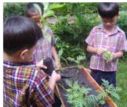
Children Understand Their Roles as Responsible Citizens

Because education is so crucial to all other aspects of development, the Village Development Partnership uses the Lamplaimat Pattana Schools as a model for change in economic and social advancement of nearby villages who now perceive the school as a place of learning for people of all ages. The Lamplaimat Pattana Schools benefit the entire community, since thousands of visitors observe the educational techniques and receive training in its unique methodology. The primary school has been designated as “a world class school” by the University of Tasmania, Australia.