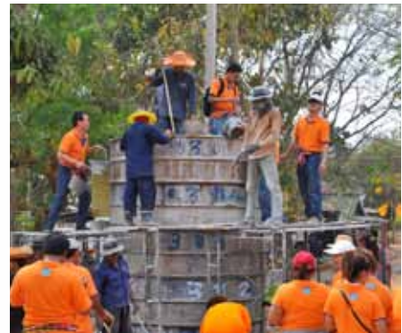
Water Tank Construction Improves Village Health and Income

Other activities that the company or organization wish to sponsor in the community can be tailored to their interests by the VDP staff (e.g. a sponsor from the medical community could establish a health link between a rural government hospital and an urban hospital).