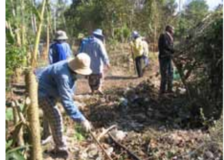
Village Cleaning Improves the Local Environment