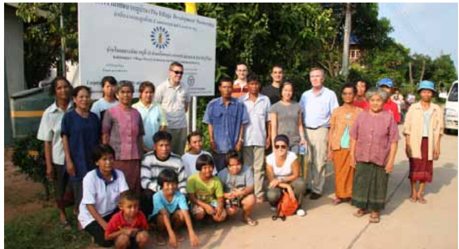
Sponsoring Company Personnel and Villagers